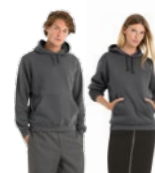
with B&C Hooded